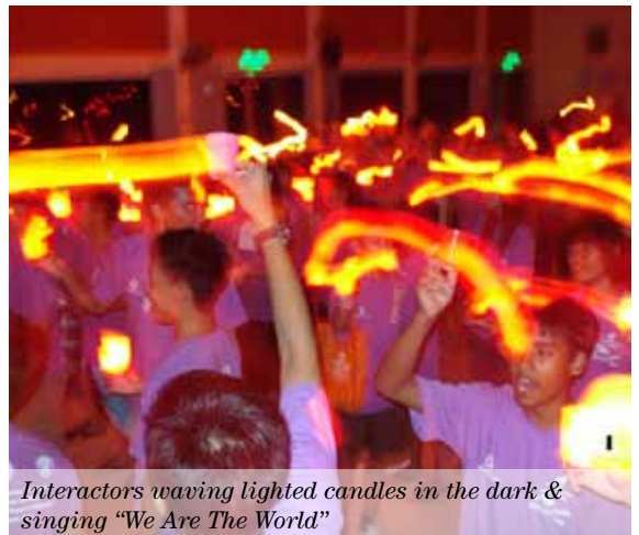
Interactors waving lighted candles in the dark & singing "We Are The World"