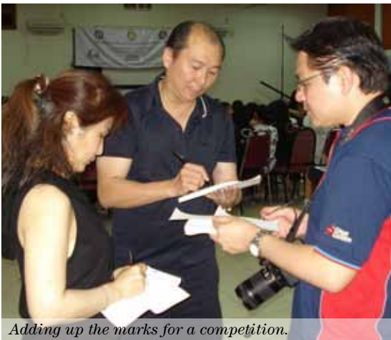
Adding up the marks for a competition.