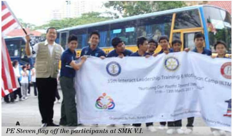
PE Steven flag off the participants at SMK VI.

● Pudu's 9 Interact Clubs participated with our Rotaractor's assistance.