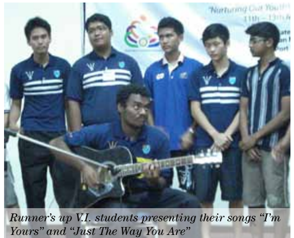
Runner's up V.I. students presenting their songs "I'm Yours" and "Just The Way You Are"