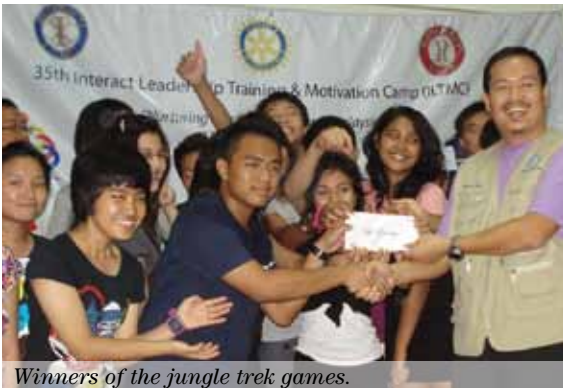
Winners of the jungle trek games.