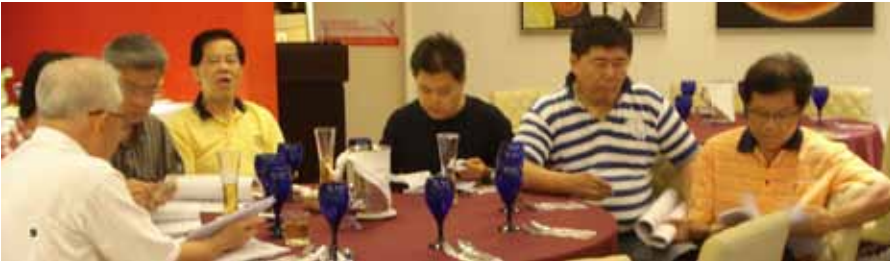
Members engrossed with our Club report.