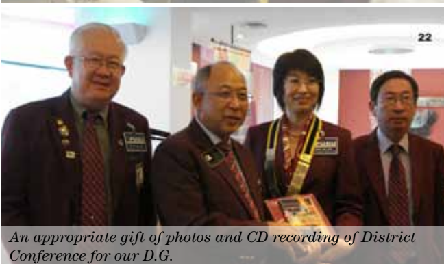
An appropriate gift of photos and CD recording of District Conference for our D.G.