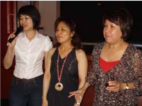
The singing Pudu "sisters" entertain at karaoke.