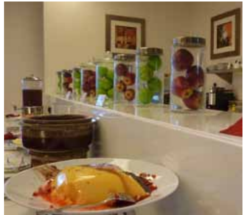
The spread of desert & sweets was tempting.