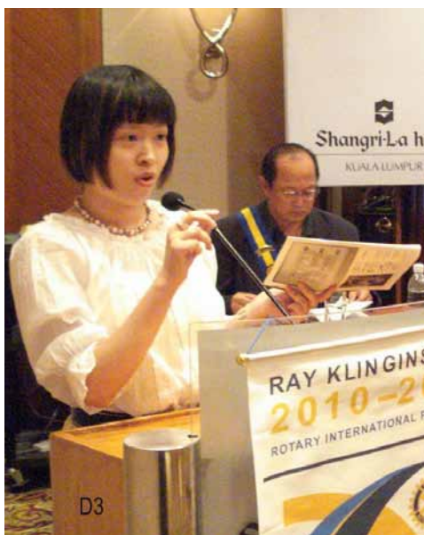
"HELLO, ANYBODY THERE?"