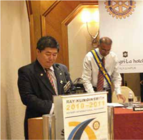
VP Heng first fine-tuning session in 2011.