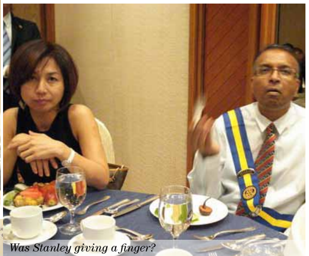
Was Stanley giving a finger?