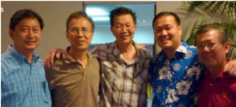
PP Phang was warmly welcomed after a long absence.