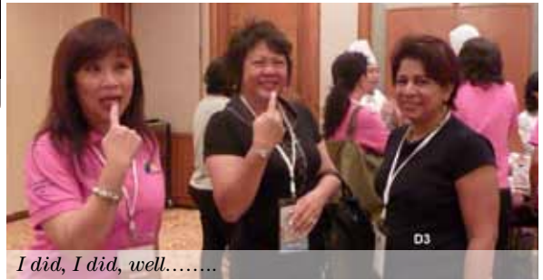
I did, I did, well.....