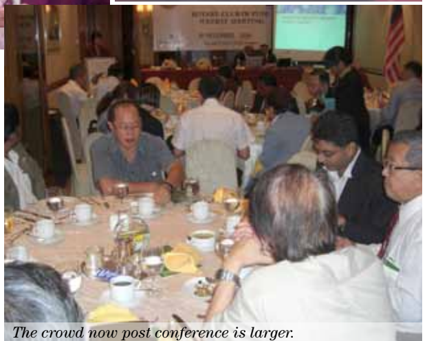
The crowd now post conference is larger.