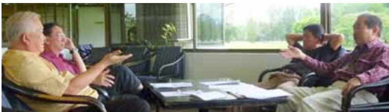
A quiet discussion before the AGM.