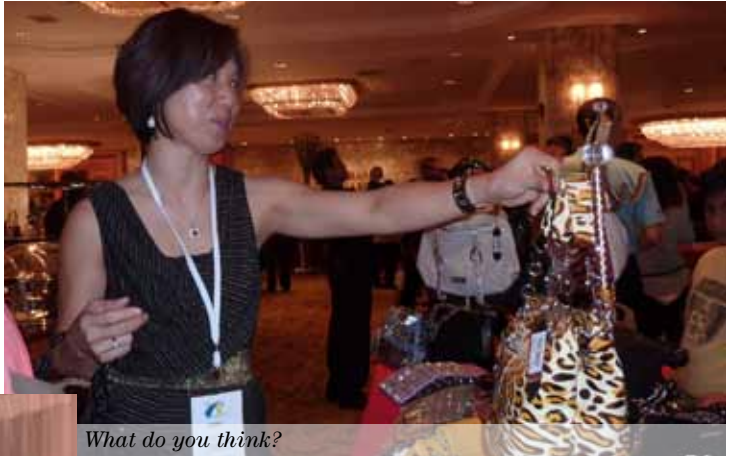
What do you think?