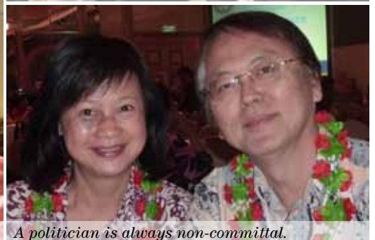
A politician is always non-committal.