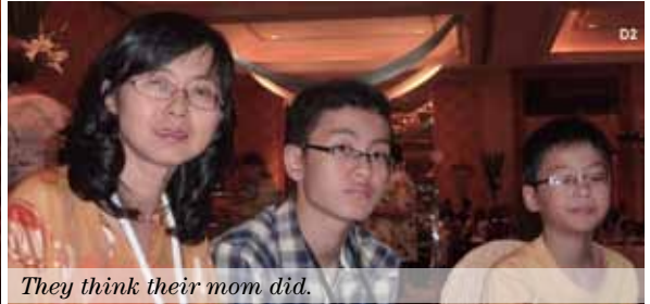
They think their mom did.