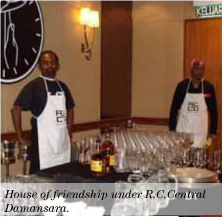
House of friendship under R.C. Central Damansara.