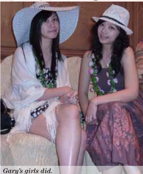
Gary's girls did.