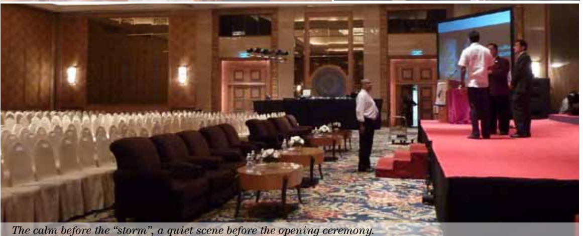
The calm before the "storm", a quiet scene before the opening ceremony.