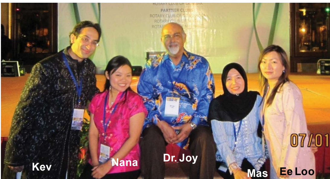
MEMBERS OF GSE TEAM

It seems like a fantastic journey for the GSE Team members and well worth the efforts and preparation for our Malaysian ambassadors from D3300.