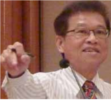
NEED AN EAGER BEAVER IN YOUR COMMITTEE.