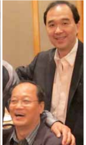
DARE NOT GO TO CHOW KIT.....BRING LAWYER ALONG).