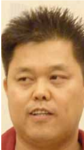
NEED A HAIR RAISING STORY.