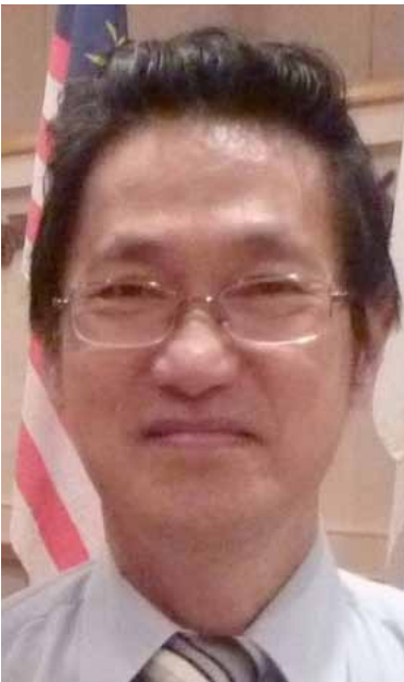
WANT NEW HAIRDO TO LOOK LIKE A YELLOW BANANA.