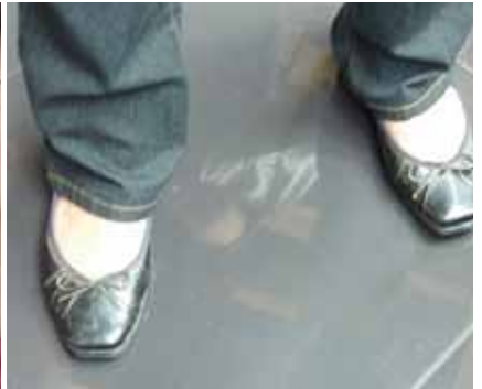
NEED REFERENCE FOR PAIR OF GEOX SHOES.