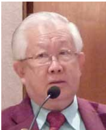
LAZY TO GOOGLE FOR ROTARY INFOR. JUST CALL HIM