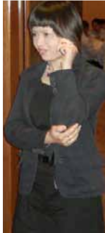
LOOKING FOR TRANSPARENCY.