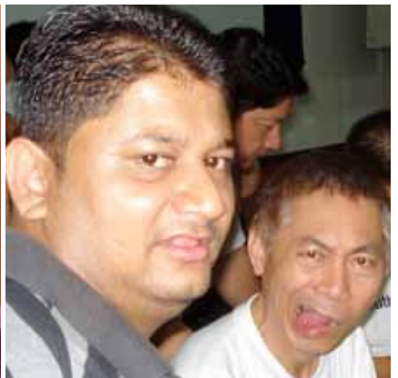
DON'T WANT TO WALK 500 MILES ~AVOID CALLING GUY ON RIGHT