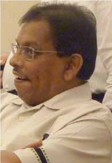
NEED HELP TO FINISH YOUR WHISKY.