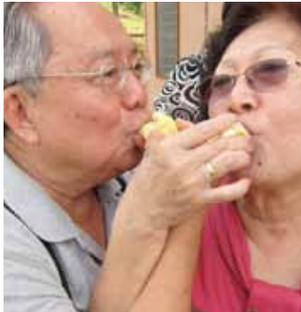
NEED A DOCTOR TO PRESCRIBE APRODISIAC.