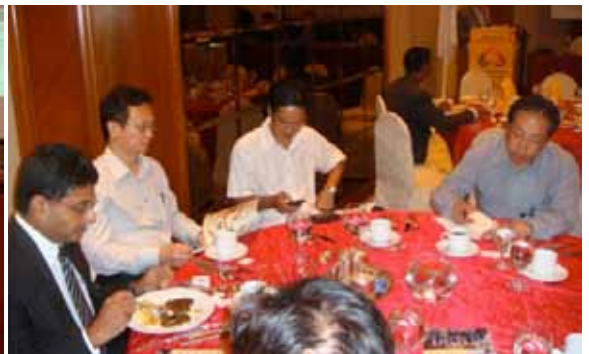
Members with guests enjoying their lunch.