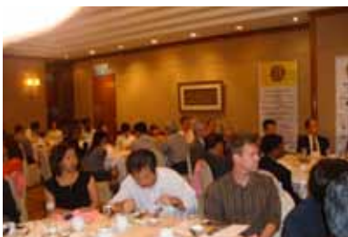
Visitors enjoying their lunch.