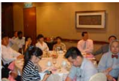
Visitors listening attentively.