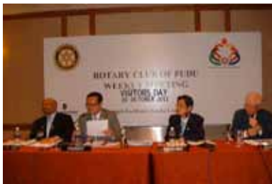
Visitor's Day Luncheon backdrop