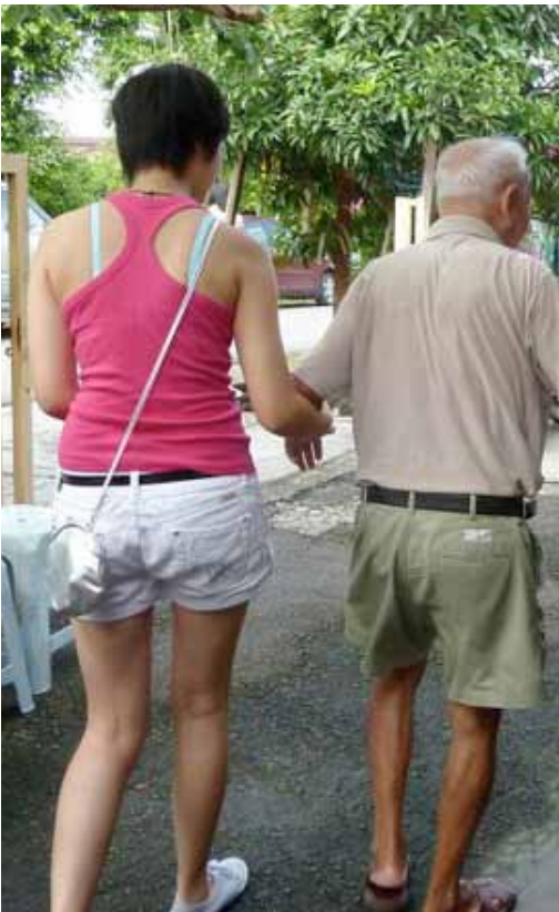
This picture sums it all up.....Rotaractor helping one of the inmates.