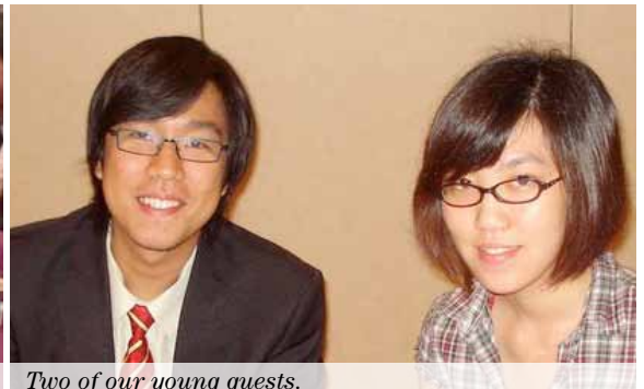
Two of our young guests.