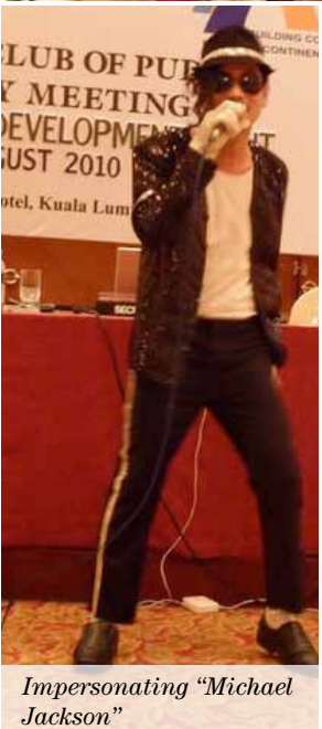
Impersonating "Michael Jackson"