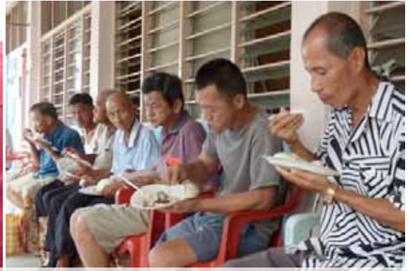
Having their "tim-sum" for breakfast for a change.