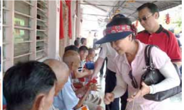
Lin telling how much Vitamin-C to take!