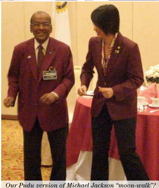
Our Pudu version of Michael Jackson "moon-walk"?