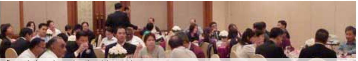
General view of crowd at the night meeting.