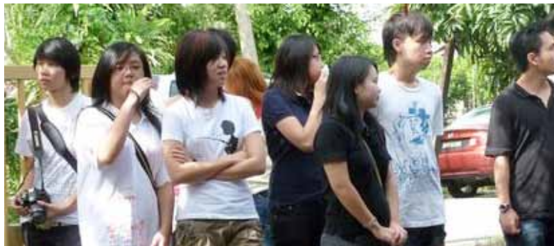
Rotaractors too turn up in numbers to assist, always appreciated.

JENJAROM OLD FOLKS HAVE NEVER SEEN SO MANY VISITORS!