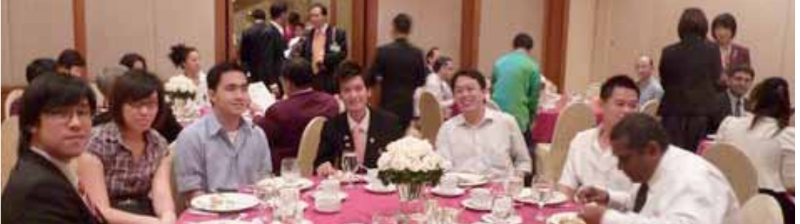
View of some of our young guests seen here with Sarky.