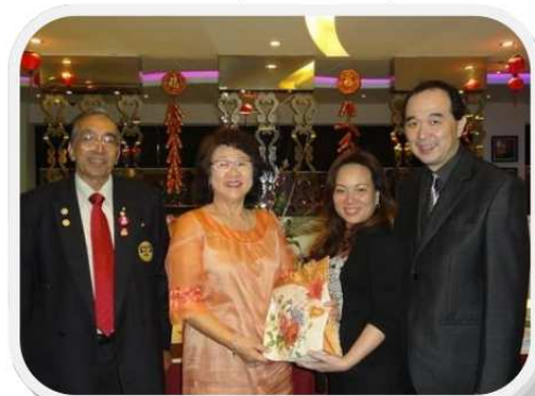
And something for the District First Lady