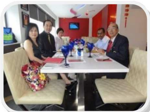
Lunch at the afternoon meeting