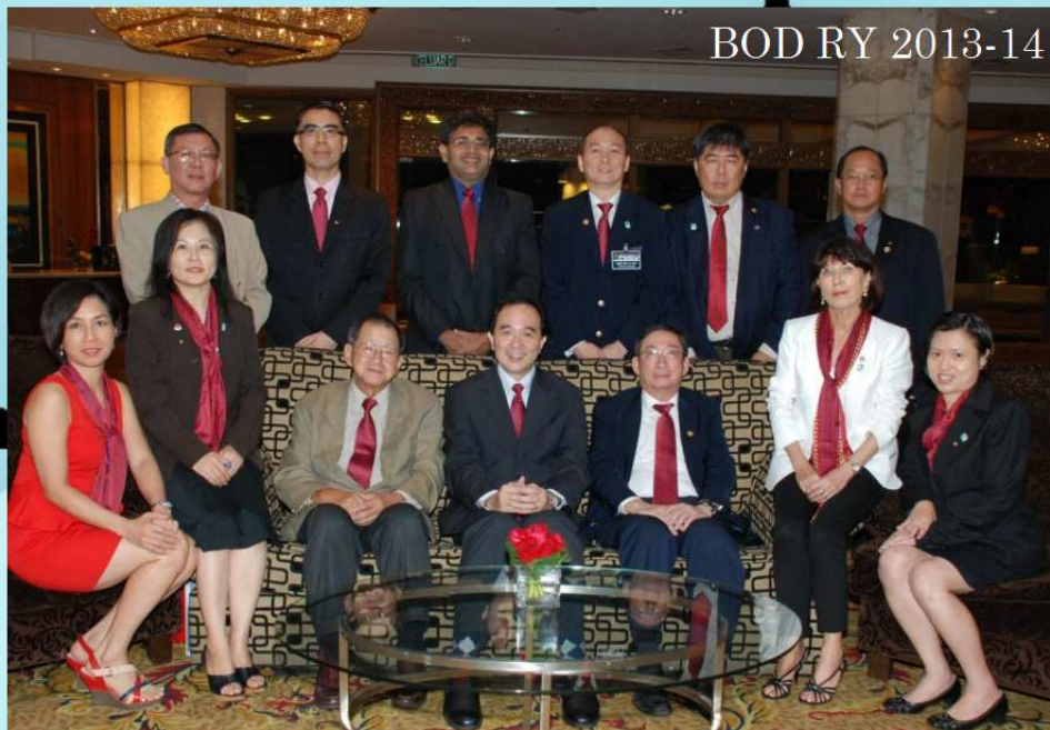
BOD RY 2013-14