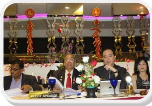
Top Table at the Assembly