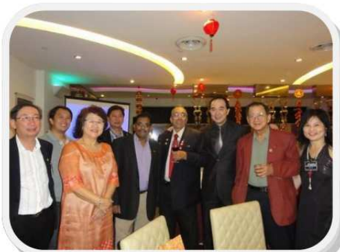
One for the album