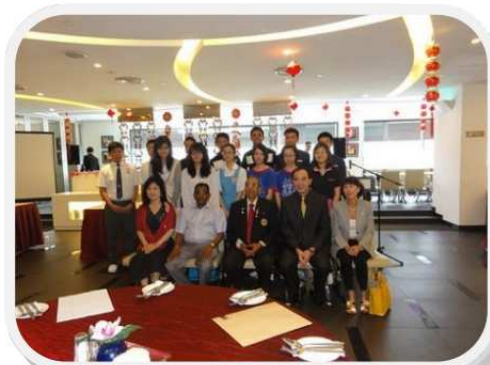
DG with Pudu Rotaractors and Interactors