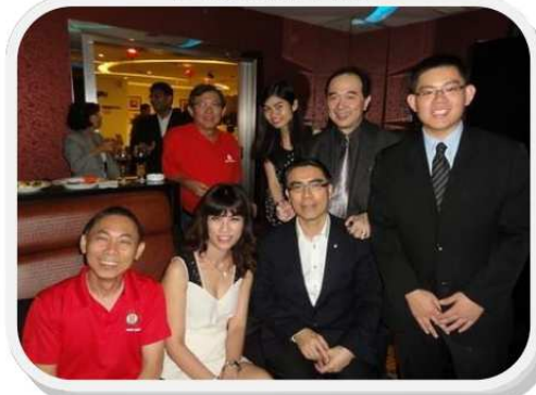
Fellowship at the Assembly