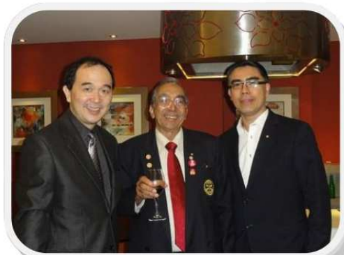
DG had a good visit