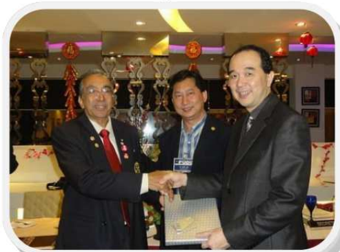
A gift for DG