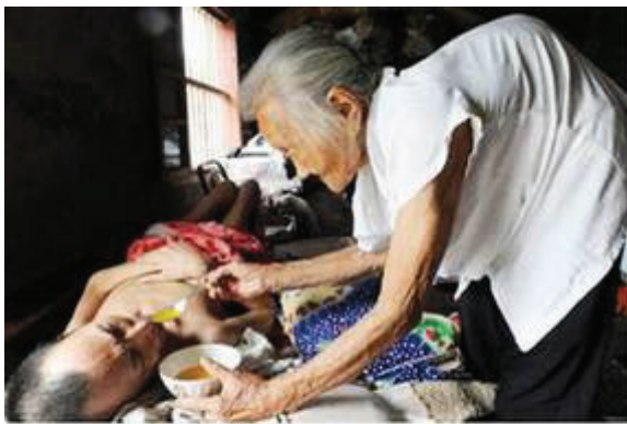
A mother (97 years old) in China, feeding and taking care of her paralysed son (60 years old) everyday for more than 19 years. A reminder of the amazing spirit of human compassion and more importantly, motherly love.