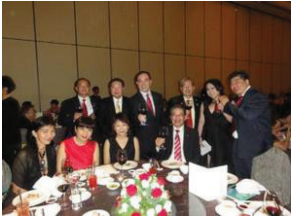
With Singapore West