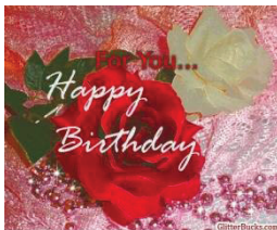
Happy birthday Elaine. Enjoy your durian...