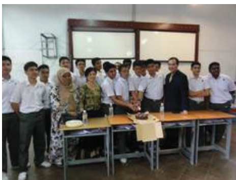
SMK Victoria Institution Interact Installation