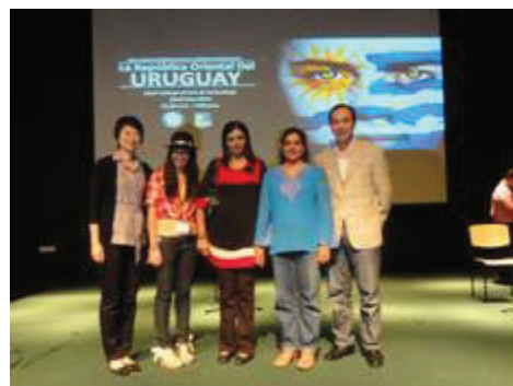
SMK Cheras IU show