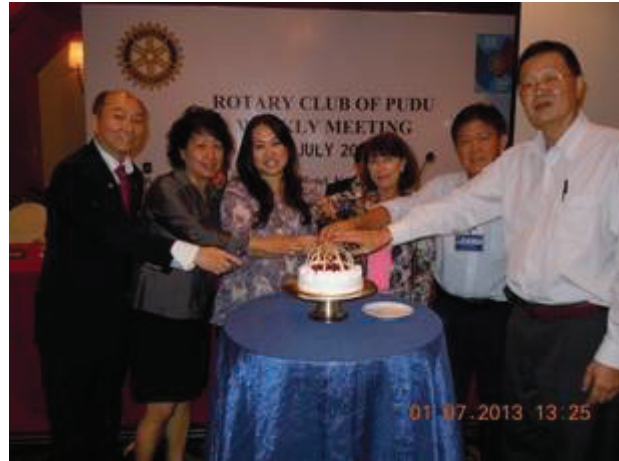
Birthday people. All got fined RM 5 each