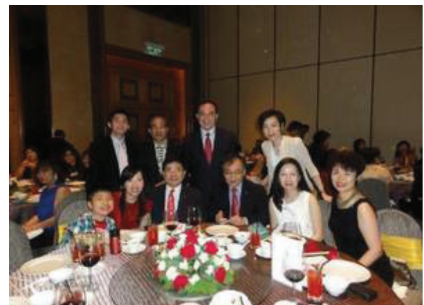
With Hong Kong Harbour