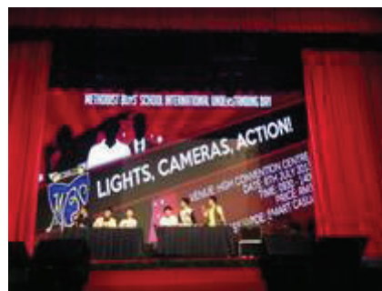
MBS Interact IU Day