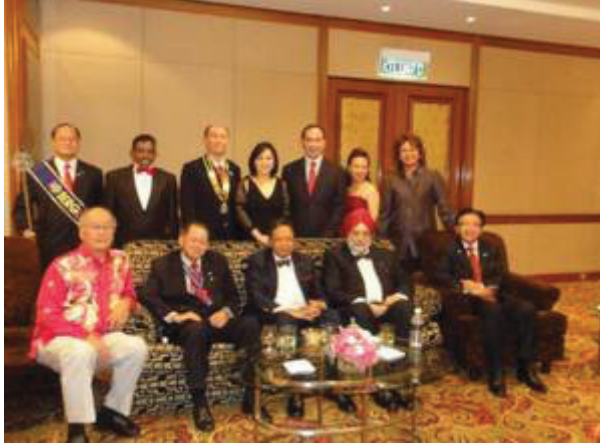
VIPs in the ante room