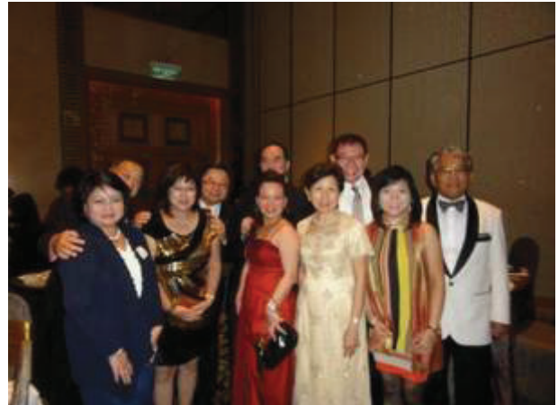
With Singapore West