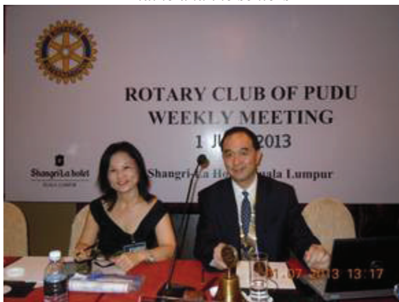
President with his Secretary