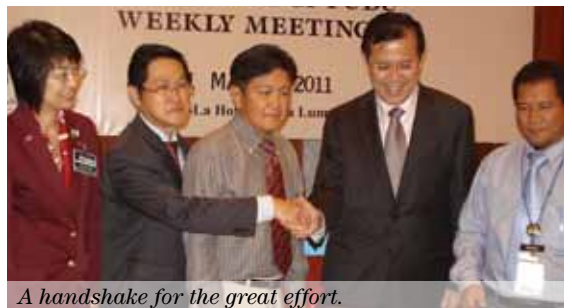
A handshake for the great effort.

WHEEL CHAIR PROJECT & TALK ON THALASSAEMIA ON 21ST MARCH, 2011