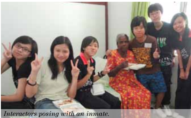
Interactors posing with an inmate.