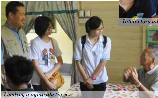
Lending a sympathetic ear.