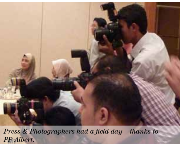
Press & Photographers had a field day – thanks to PP Albert.