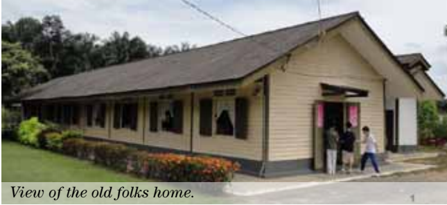
View of the old folks home.