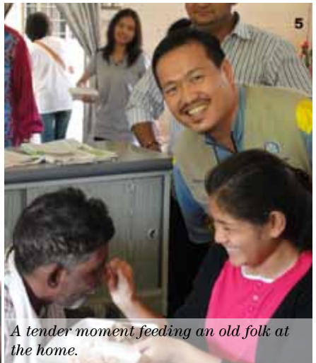
A tender moment feeding an old folk at the home.