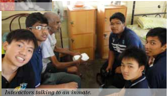
Interactors talking to an inmate.