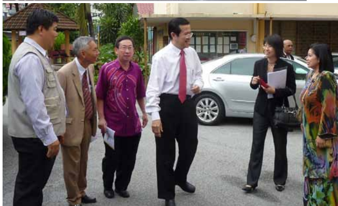
Arrival of Dato' Ong Tee Kiat.