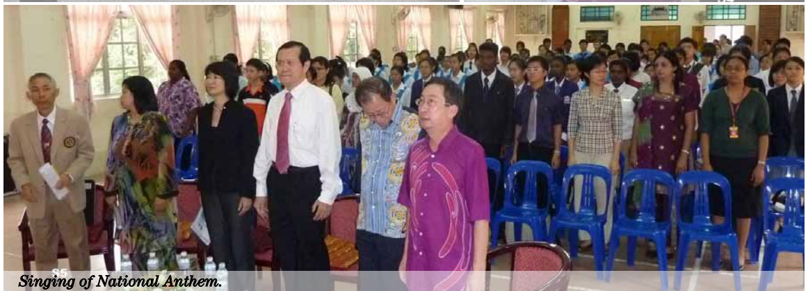
Singing of National Anthem.