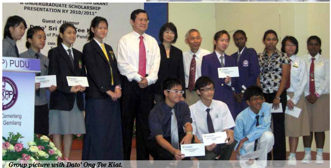
Group picture with Dato' Ong Tee Kiat.