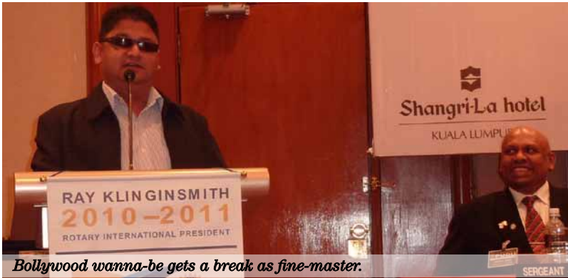
Bollywood wanna-be gets a break as fine-master.