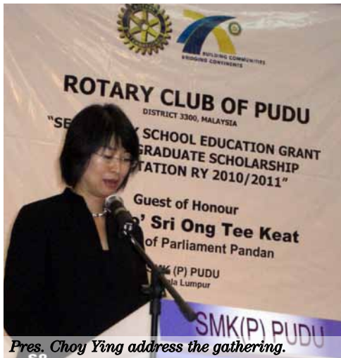
Pres. Choy Ying address the gathering.