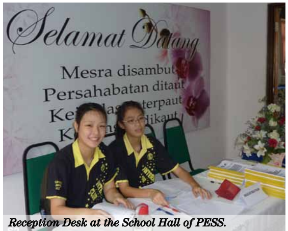
Reception Desk at the School Hall of PESS.