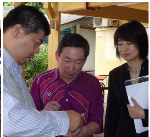
A quick discussion.