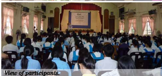
View of participants.