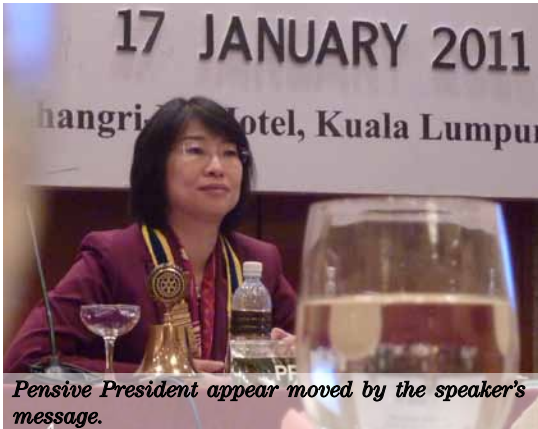
Pensive President appear moved by the speaker's message.