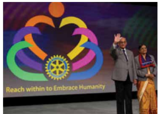
RI President-elect Kalyan Banerjee announces the 2011-12 RI theme during the International Assembly in San Diego, California.

"In order to achieve anything in this world, a person has to use all the resources he can draw on. And the only place to start is with ourselves and within ourselves," Banerjee said.