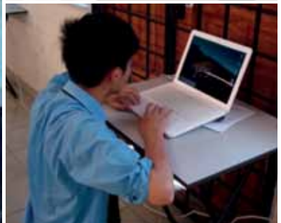
A PPT Presentation.