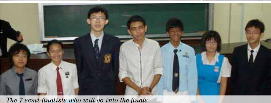
The 7 semi-finalists who will go into the finals

DON'T MISS THE FINALS ON 25TH SEPT AT SMK (P) PUDU at 10.00am in the morning! PUDU