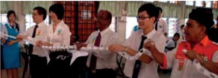
Show begins.....the ribbon is "torn"!!