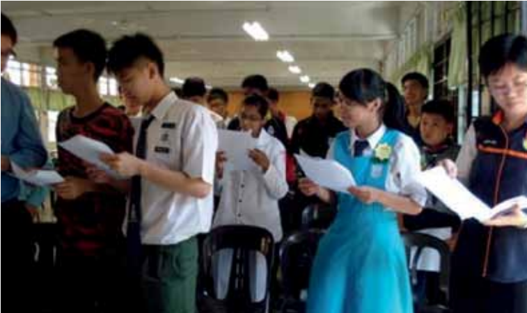
Interactors sang "Heal the World" with feelings that touches the heart.