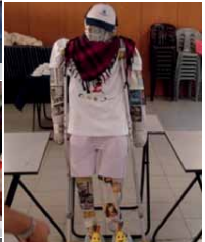
They created an innovative "polio stricken" model.