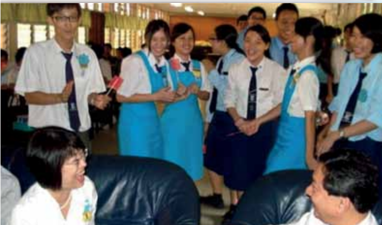
We communicate well with our Interactors.