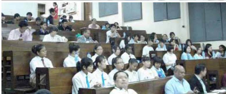
Section of the crowd at the lecture hall.