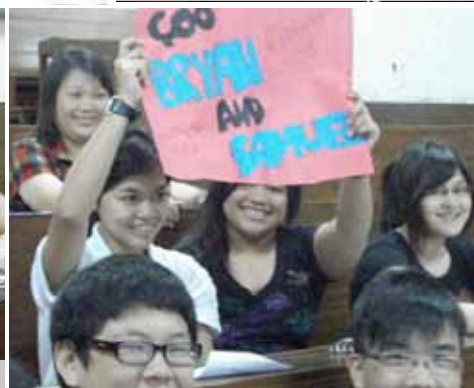
Yes, there were some happy supporters.