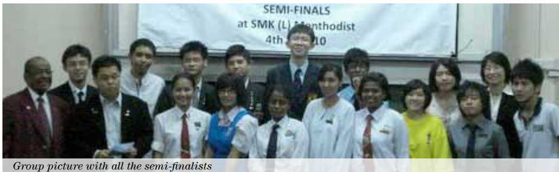
Group picture with all the semi-finalists