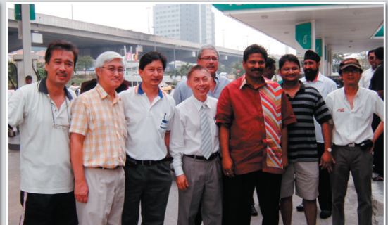
YB Sentaor Kohilan Pillay, the Deputy Minister of Foreign Affairs (in Batik) graciously launched the project on the 1st August 2009 at Jidousha Salon Sdn Bhd, c/o Petronas Service Station, Lot 29071 & 29072, Taman Samudera, 68100, Batu Caves, Kuala Lumpur (next to Giant Hypermart).