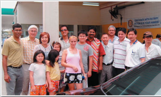
YB Senator Kohilan Pillay the Deputy Minister of Foreign Affairs took a group photos with Rotarians, spouses, family members and the Beacon Life Training Centre, Downs Syndrome children during the launched.